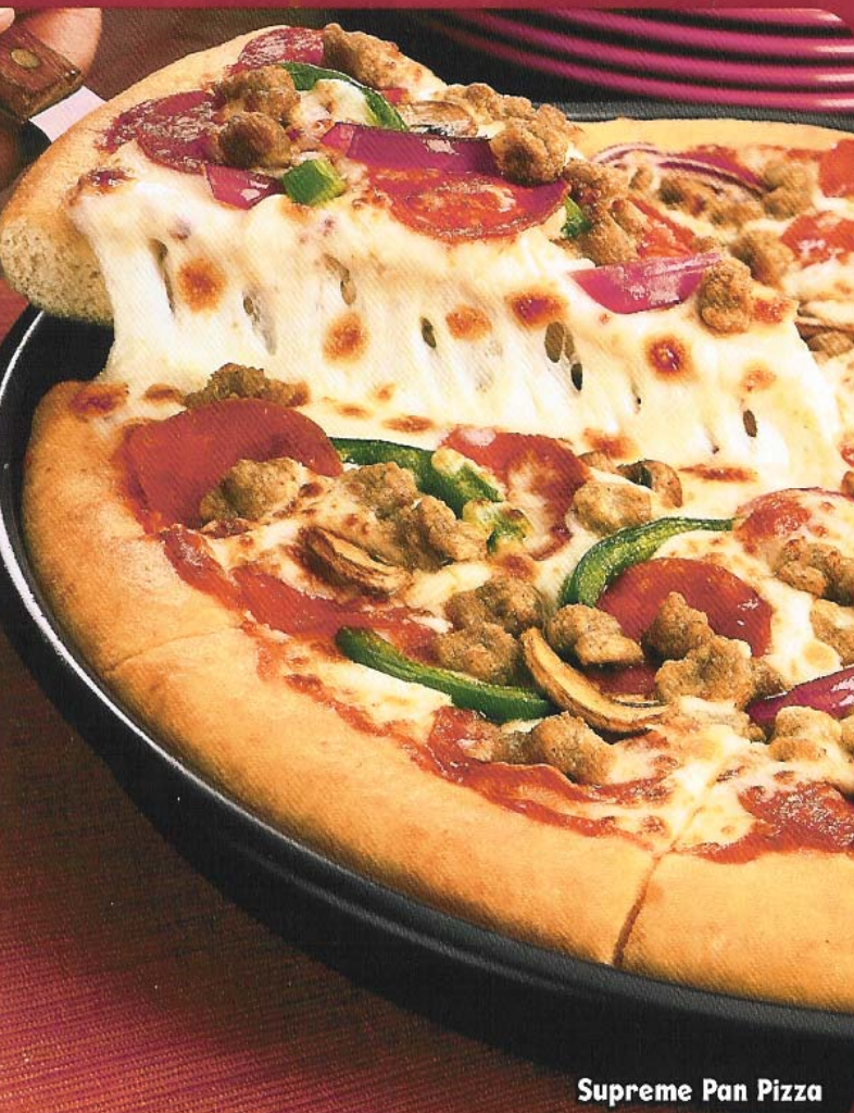
Supreme Pan Pizza