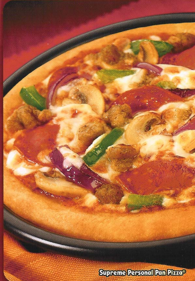
Supreme Personal Pan Pizza®