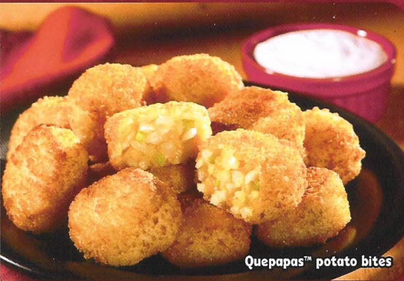
Quepapas™ potato bites